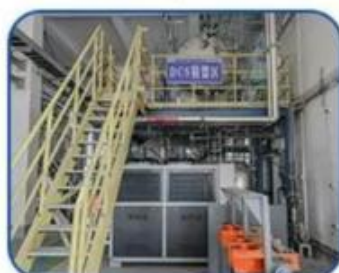
Zone of rectification